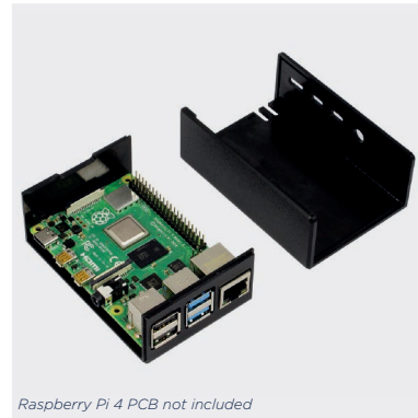
Raspberry Pi 4 PCB not included